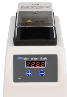
WB-02A LED Digital Bath

Both models come with (WBA14) Vapor Cover