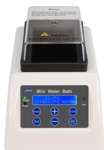
WB-01A Programmable Digital Water Bath

High-Precision Instrument with Sophisticated PID Temperature Control System Provides Reliable Results. Automatic Overheating Alarm to Prevent Dry Burning