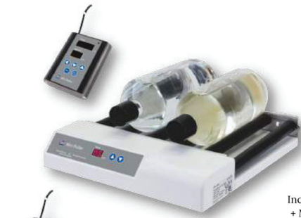
MR-01UA Includes 6 standard rollers + MRA02, MRA03, MRA05