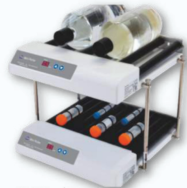
MR-01UA and MR-03UA can be Stacked using accessory stacking bars Accessory: MRA04 (Pack of 4)