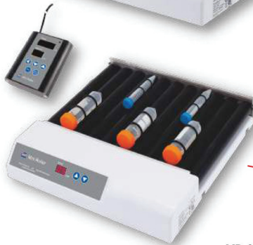
MR-03UA Includes 11 "3D" Rollers + MRA02, MRA03, MRA05