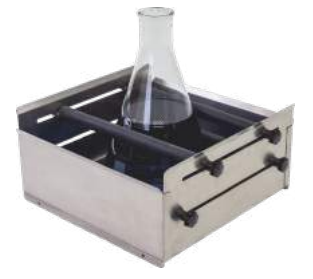
Platform with 2 Adjustable Bars for Large Flasks for SYC-2102A OSA03