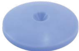
VMA01 Single Tube Head

For over 25 years Crystal Technology and Industries has been driven to deliver exceptional value to the scientific marketplace by developing innovative equipment and Cryo Storage Solutions for today's scientist.