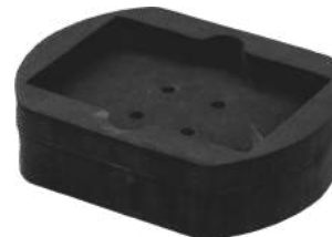
VMA07 Elisa Plate Holder