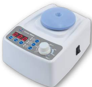
VM-01UA Vortex Mixer with Digital Timer and Analog Speed

Vortex Mixers are essential research lab instruments used for mixing and stirring in a variety of mixing applications. These mixers are powerful, quiet, and stable.