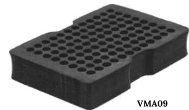
VMA09 PCR Tube Holder