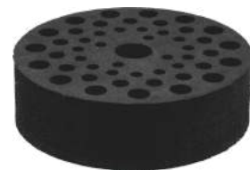
VMA08 Combo Tube Holder