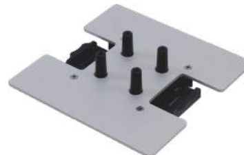
VMA03 Adaptor for VMA07, VMA08, VMA09