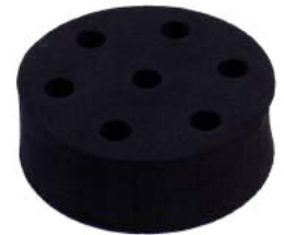
VMA04 Ø12mm Tube Holder