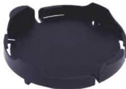
VMA02 Adapter for VMA04 and VMA05