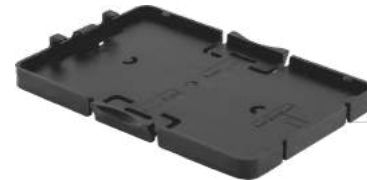
VMA06 Microplate Holder