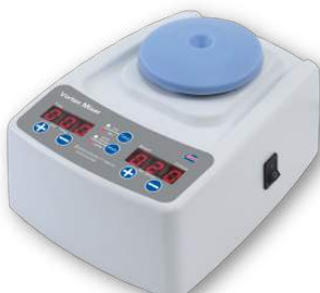
VM-02UA Vortex Mixer with Digital Timer and Speed