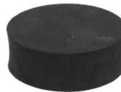
VMA05 Customizable Tube Blank