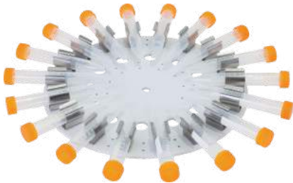
Carousel for 15mL Tubes TRA21