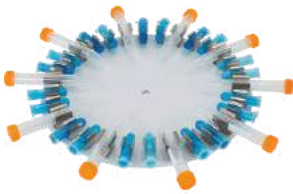
10ml, 15ml, 5ml, 7ml Assembly TRA26