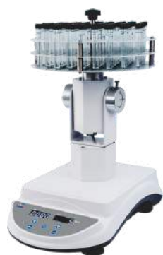
High Capacity Tube Rotator TR-05UA (180°)