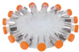
50ml Rotator assembly TRA25