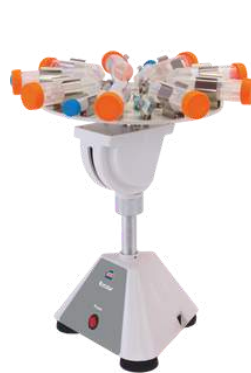
Standard Tube Rotator TR-03A (180°)