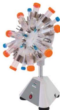
Standard Tube Rotator TR-03A (130°)