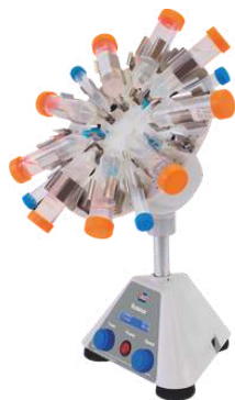
Digital Tube Rotator TR-04UA (130°)