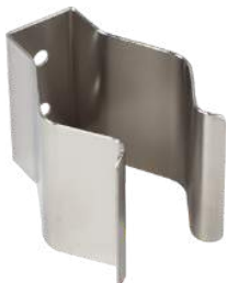
Tube Holders for 50mL Tubes TRA15