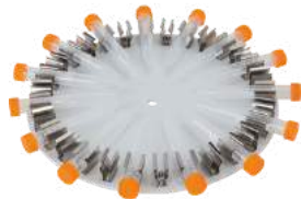
15 ml Rotator Assembly TRA24