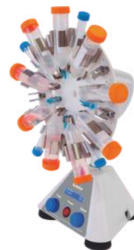
Digital Tube Rotator TR-04UA (90°)