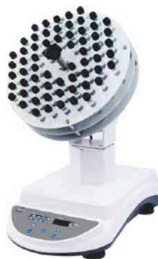
High Capacity Tube Rotator TR-05UA (45°)