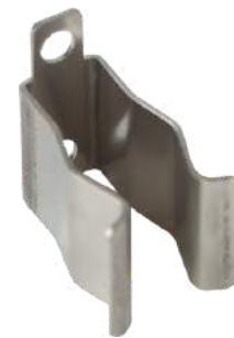
Tube Holders for 2mL Tubes TRA17

For over 25 years Crystal Technology and Industries has been driven to deliver exceptional value to the scientific marketplace by developing innovative equipment and Cryo Storage Solutions for today's scientist.