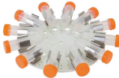
Carousel for 50mL Tubes TRA22