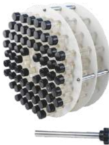
Drum for 18.5mm culture tubes Dia. 18.5 mm TRA28