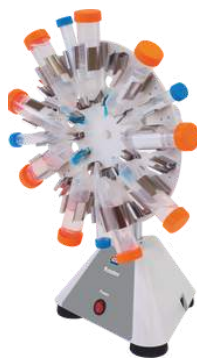
Standard Tube Rotator TR-03A (90°)

Tube Rotators are the ideal instruments for applications requiring highly efficient and consistent mixing. They are widely used in clinical, research, and academic laboratories. Crystal Tech offers both a fixed speed Tube Rotator as well as a variable speed model with a timer. This High-Capacity Tube Rotator is well suited for the high throughput mixing of samples of various sizes.