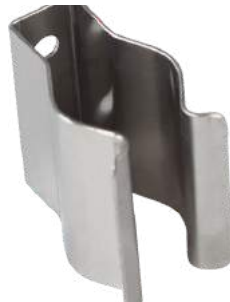
Tube Holders for 5/10/15/20mL Tubes TRA16