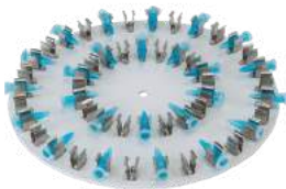
1.5ml and 2.0 ml Rotator Assembly TRA23