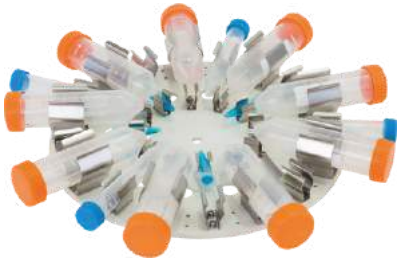
Carousel for 2mL, 15mL, 50mL Tubes TRA19