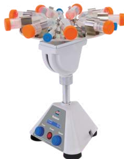
Digital Tube Rotator TR-04UA (180°)