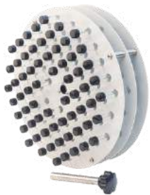
Drum for 14mm culture tubes Dia. 14mm TRA27