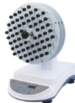
High Capacity Tube Rotator TR-05UA (95°)