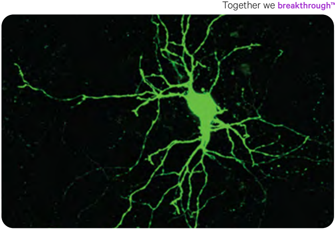
Fast-spiking interneurons of mouse brain striatum filled with NEUROBIOTIN 488. S. Russo, G. et al (2013) Front. Cell. Neurosci. Vol. 7, Article 209.