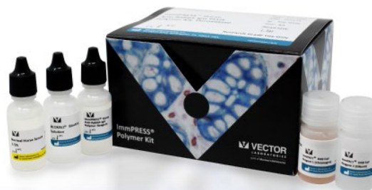
ImmPRESS HRP Horse Anti-Rabbit IgG PLUS Polymer Kit, MP-7401