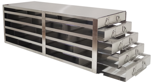
UFD-352-T6 Stores (15) Pfizer Covid-19 Vaccine Boxes

All Crystal freezer racks come with our unconditional lifetime warranty