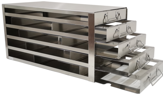
UFD-252-T2 Stores (10) Pfizer Covid-19 Vaccine Boxes