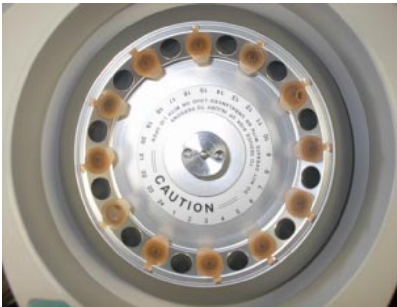
Figure 1. Loading the rotor to achieve balance